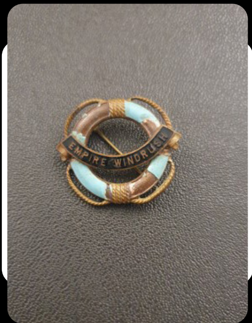
Windrush Pin purchased from The Souvenir Shop aboard the Windrush Ship – 1950s.