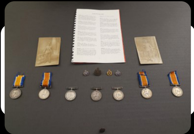
WW1 Collection - British War Medal, Regimental Sweetheart pins, Collar Pin, Images of 2 Soldiers from the British West Indies Regiment.