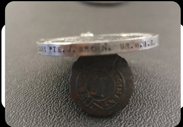
The British War Medal was awarded to military personnel serving in any of the Sovereign's forces in the British Empire during The Great War, 1914-1918. The button is from the tunic of a Soldier from the 1st West India Regiment (the first colonial regiment made up of slaves), and dates from 1795.